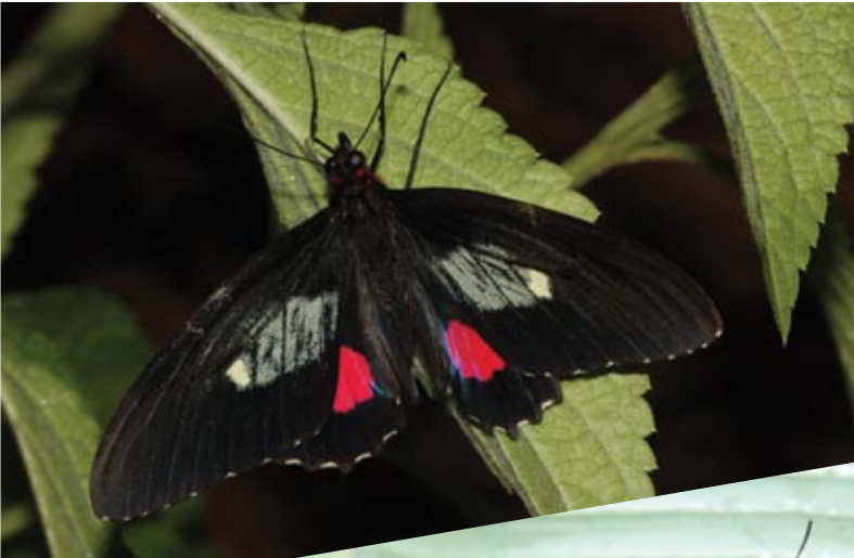
Parides erithalion male