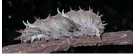
Parides larva on Aristolochia

Three other species of Parides can be found in the Piedras Blancas National Park. One of the most common ones is Parides iphidamas , which is tolerant of disturbed habitats. The males of these species can be distinguished from each other mainly by the shape of the green band. However, the females are extremely similar to each other and often cannot be reliably identified.