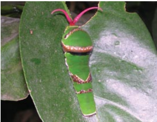
Papilio larva with everted osmaterium