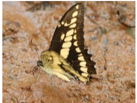
Mud puddling swallowtail ( Heraclides thoas )