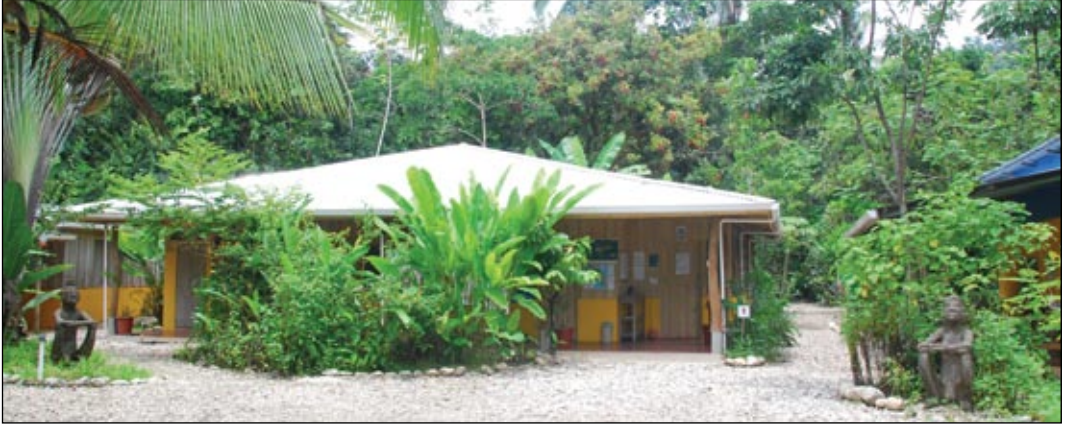
The main building of the Tropical Research Station

Secretary General of the 'Society for the Preservation of the Tropical Research Station La Gamba' Department of Chemical Ecology and Ecosystem Research, University of Vienna