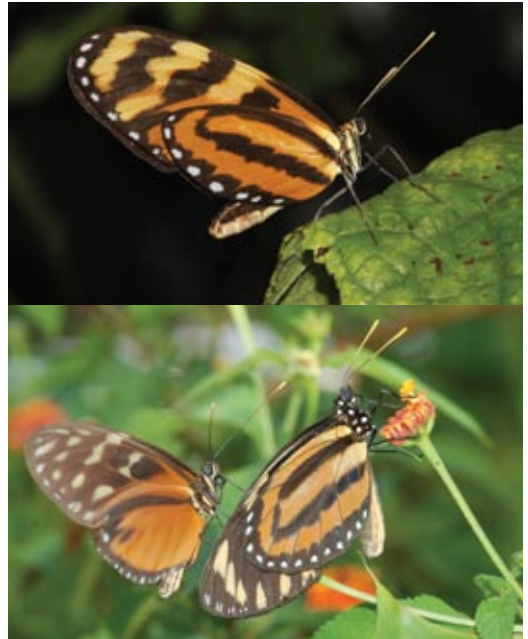
Mimicry ring with Mechanitis lysimnia (top), Heliconius hecale (bottom, left) and Lycorea halia (bottom, right)

In the second type, Müllerian mimicry, all involved butterflies are more or less distasteful and have evolved a similar color pattern of the wings. They profit from the mimetic resemblance since a predator will learn faster when the warning color pattern is more frequent. This type of mimicry is much more common, and it is considered to be a more stable evolutionary strategy.