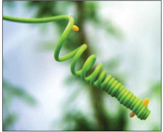
Eggs of Heliconius melpomene

During the pupal stage, larval tissues are broken down, and the new organs of the adult become differentiated (i.e., metamorphosis). Fi-