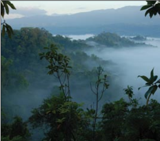
Morning clouds above the forest

The Golfo Dulce region is located in the southern corner of the Pacific coast of Costa Rica, near the border with Panama. Within this region are the Corcovado and Piedras Blancas national parks. The forests of the region are the only moist or wet evergreen lowland forests that still exist on the Pacific coast of Central America. The elevations range from sea level to 745 m on the Cerro Rincón, Peninsula de Osa; the annual precipitation is up to 6,000 mm with a short or almost nonexistent dry season from December until March; the relief is strongly structured at the landscape level and contains many microhabitats