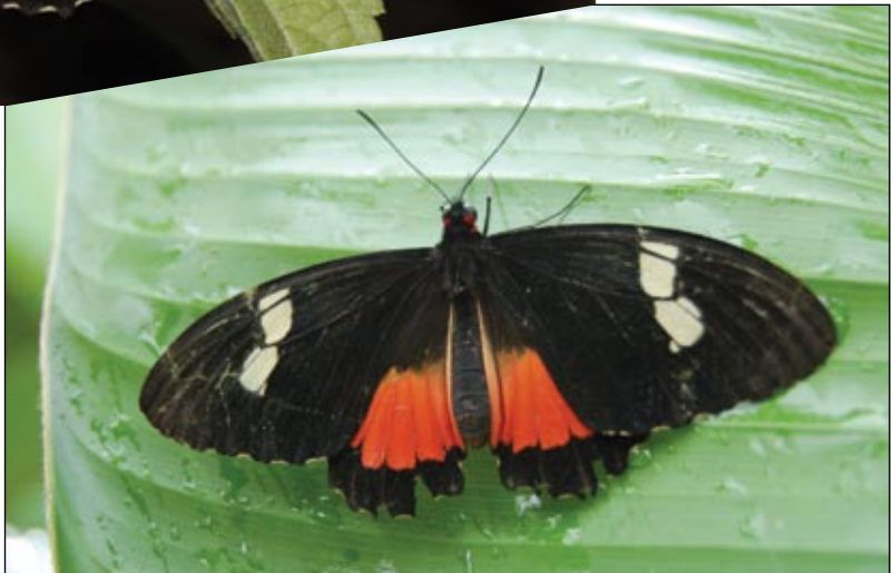
Parides erithalion female