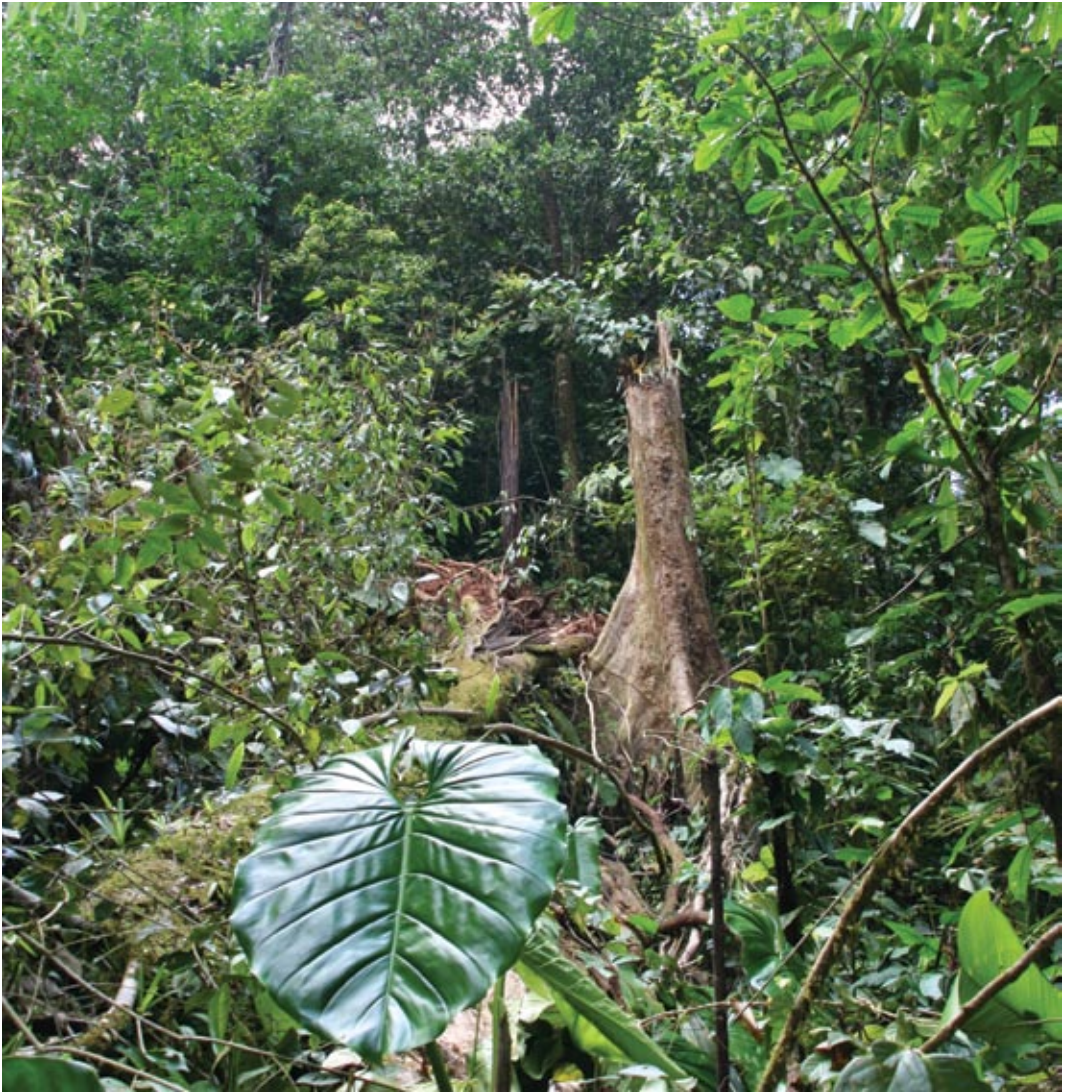
Rainforest gap in the Piedras Blancas National Park. In natural rainforests, gaps are regularly produced by fallen trees. Many butterfly species such as those of the Swallowtail genus Parides are most easily observed in light gaps.