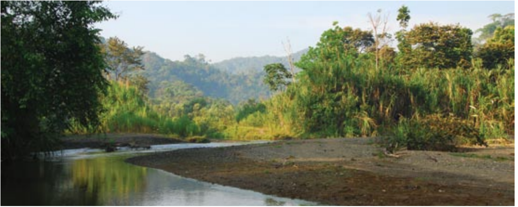
The Río Bonito in the NP Piedras Blancas

Anacardium excelsum , Parkia pendula , Carapa guianensis , Brosimum utile and Caryocar costaricense . Most trees retain their foliage throughout the year. Palms (about 45 species) such as Socratea exorrhiza , Iriartea deltoidea , Welfia regia and Asterogyne martiana are typical features of the forest. Heliconia herbs are obvious near streams and in gaps. Lianas (e.g. Bauhinia and Entada ), vines and epiphytes (Bromeliaceae, Orchidaceae) are found on many trees. About 100 species of orchid (e.g. vanilla) and 40 species of bromeliad are distributed in the region.