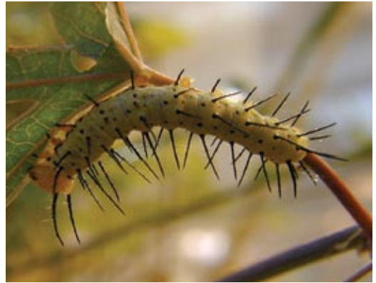
Larva of Heliconius melpomene