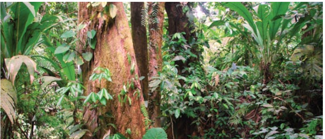
Interior of the forest of the NP Piedras Blancas

Costa Rica’s geographic location on the ‘bridge’ between North and South America and the fact that the country formed a kind of refuge for tropical animals and plants during the last ice age has led to remarkable biogeographical patterns. Restricted-range plants and animals are abundant and many reach their northern limits in southern Costa Rica. The region is an excellent place for naturalists to enjoy tropical nature. An extensive system of trails in the Corcovado and Piedras Blancas national parks (La Gamba) offers wonderful insights into tropical rainforests.