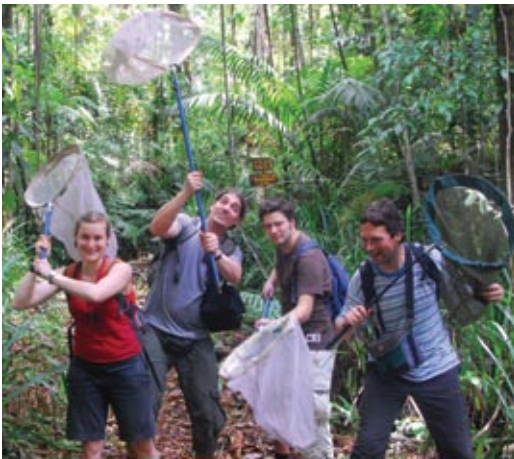
Scientists at work in La Gamba

also provided ideal conditions for promoting Austrian research and teaching programmes in rainforests. To make the area more accessible, the 'Association Rainforest of the Austrians' bought an old farmhouse (a finca ) in 1993. This formed the nucleus for a tropical field station, located directly on the border of the National Park near the small village of La Gamba. With the support of the 'Association Rainforest of the Austrians', the Ministry of Science and Research and the University of Vienna, the 'Tropical Research Station La Gamba' flourished and grew. It now comprises several buildings and includes comfortable living and research facilities for more than 30 visitors as well as a botanical garden. In 2008 an airconditioned laboratory was constructed with the support of the Faculty of Life Sciences of the University of Vienna. With its infrastructure, the field station is currently on the threshold of becoming an internationally established research institution and education centre, focussing on the exploration and conservation of Neotropical rainforests. Since its foundation, many scientists have carried out field research in the Esquinas rainforest and many visitors have admired its beautiful surroundings. As well as supporting research and teaching activities, the station helps the inhabitants of La Gamba by means of a series of applied projects to improve their living conditions. These projects are partly run in