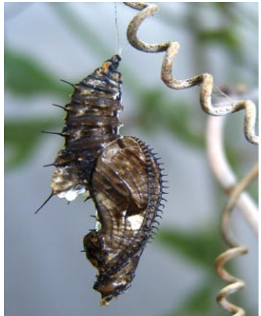
Pupa of Heliconius melpomene