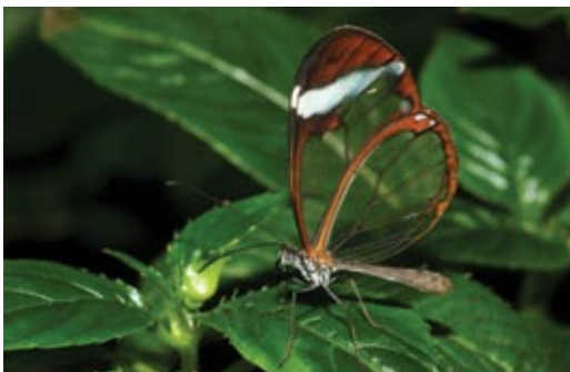
Mimicry ring with Dismorphia theucarila (Pieridae) (top), Greta oto (Nymphalidae) (bottom, left) and Phanoptis vitrina (Notodontidae) (bottom, right)