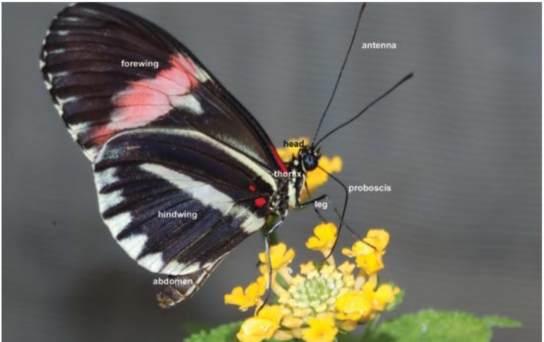
Imago of Heliconius melpomene

nal adjustments for adult life are made while the butterfly is still emerging from the pupal encasing. The wings unfold, and the adult feeding organ or proboscis becomes fully assembled.