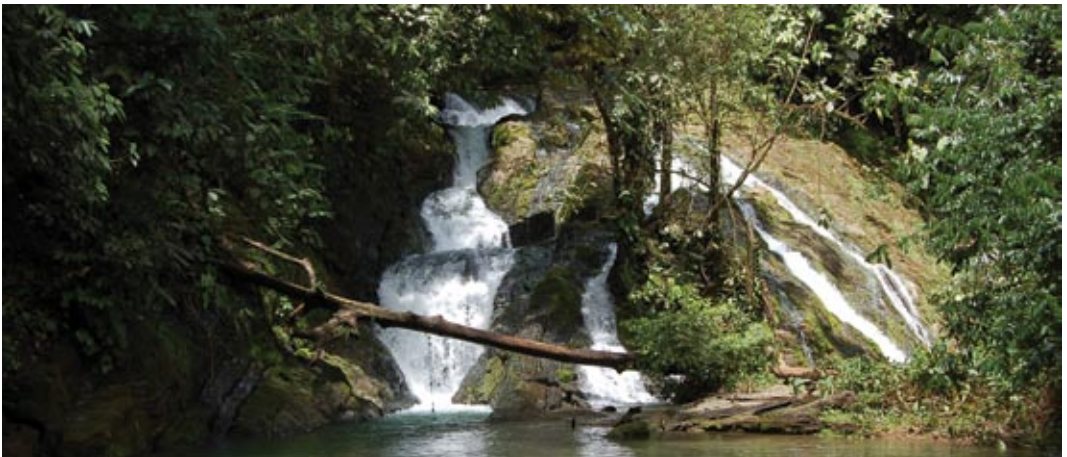
Waterfall on the Quebrada Chorro

The tallest trees in the moist and wet evergreen lowland forests grow up to 60 m high (e.g.